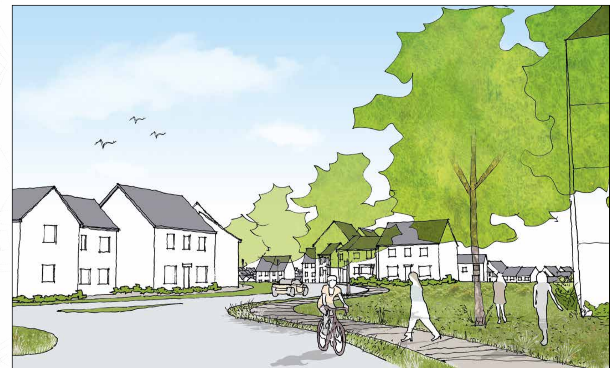
Entrance to the proposed development area