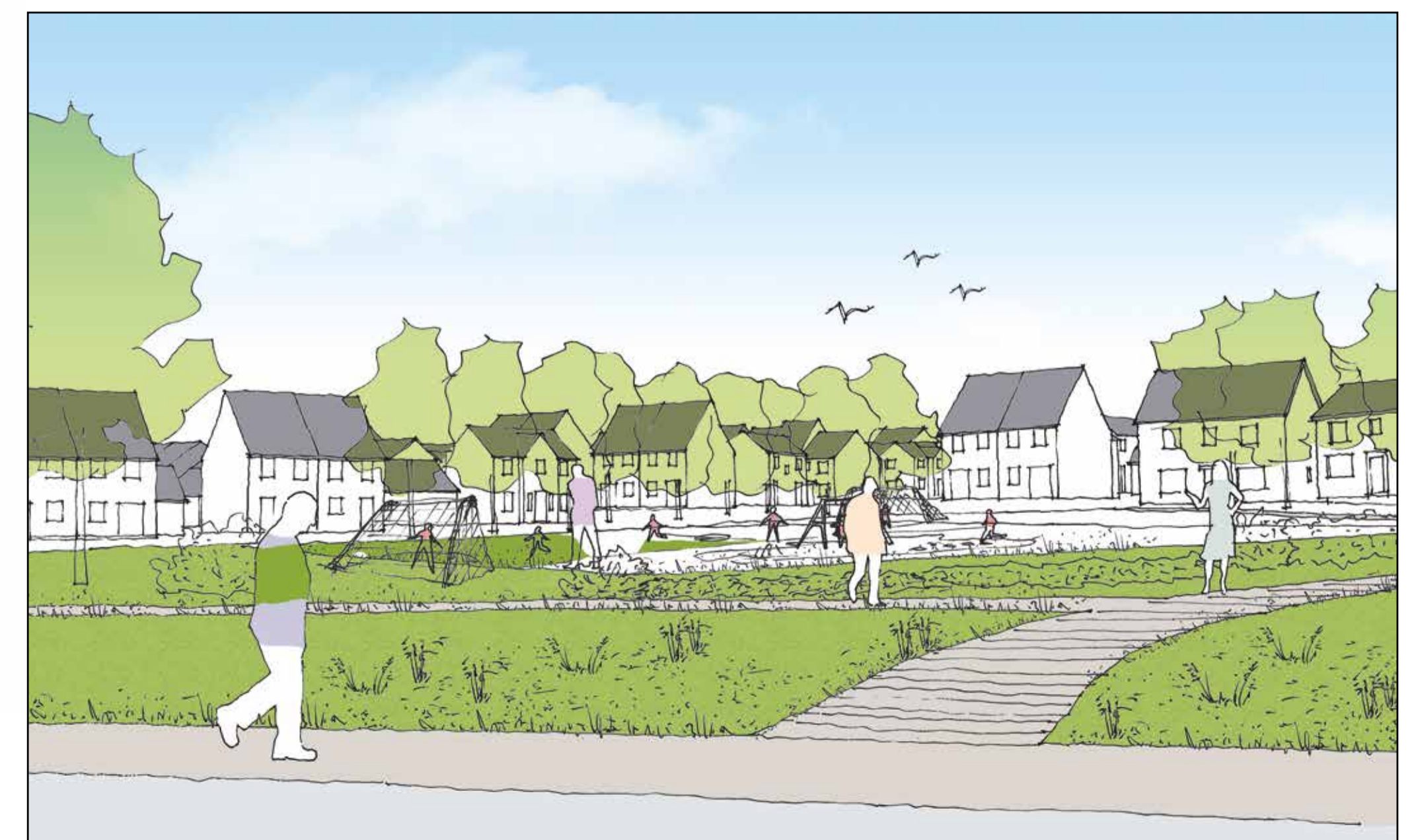
Central play area