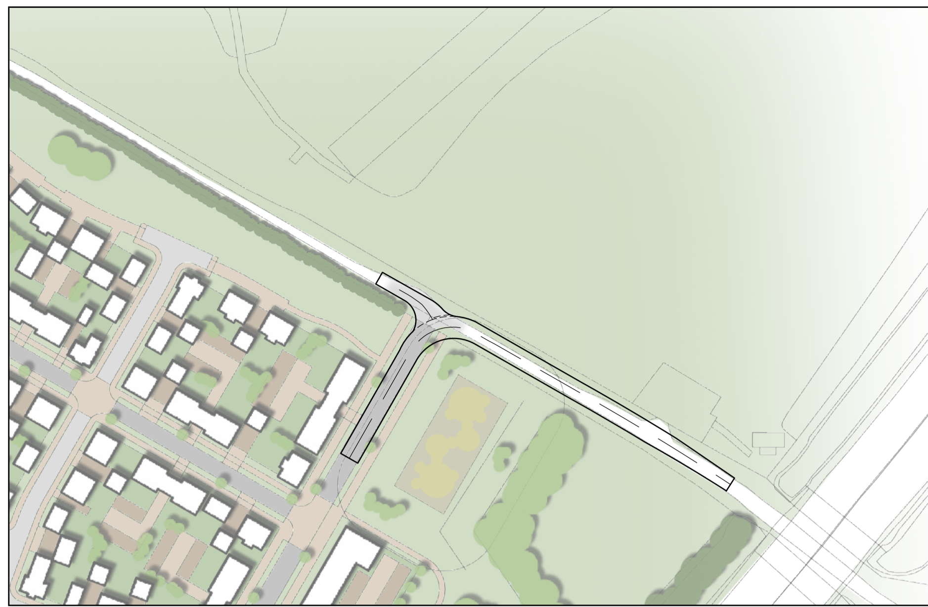
Crewe Lane Junction