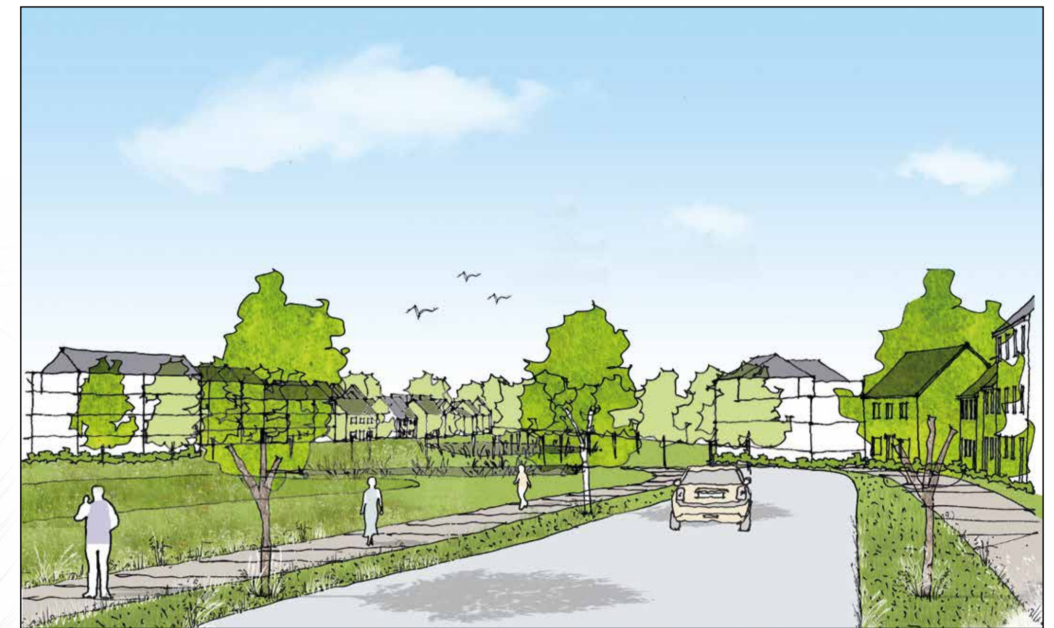
View along spine road