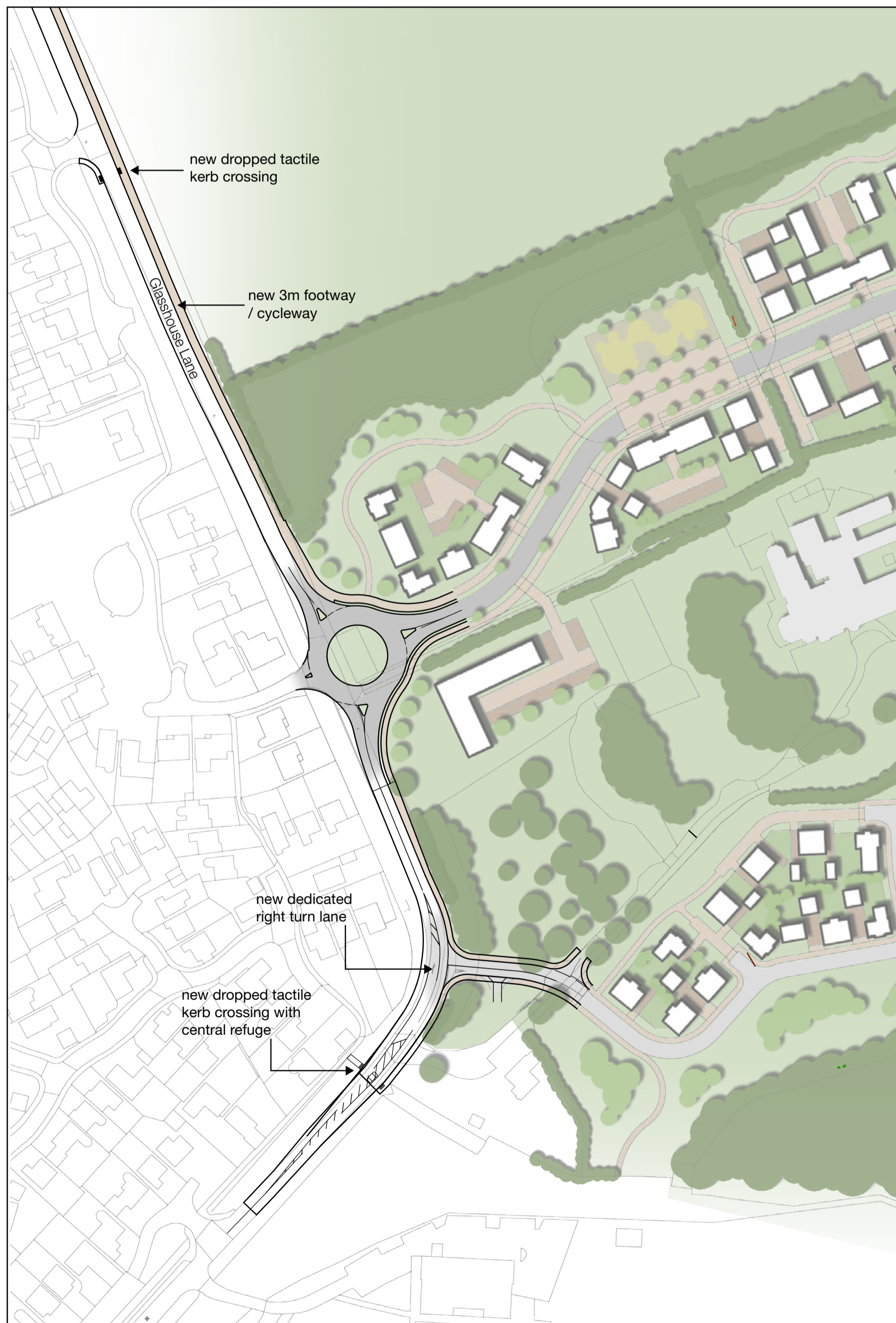
Glasshouse Lane Entrances and Improvements